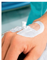
Hydrofilm® IV Control