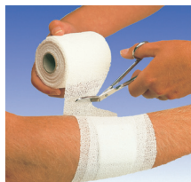
Peha-haft® Latex Free

130 years of high performance, cost effective solutions