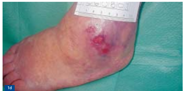
Fig. 1d After two further weeks of treatment with PermaFoam, treatment was changed over to Hydrocoll to achieve final wound closure. On August 6, 2003, the wound was closed.

The area surrounding the wound showed no visible signs of infection! The leg oedema, above all the oedema on the back of the foot, had clearly subsided under the compression therapy (circumference 26cm).