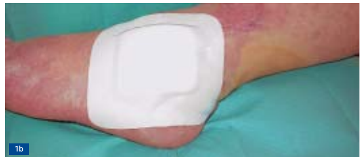
Fig. 1b Changeover to treatment with the PermaFoam foam dressing on April 4, 2003 to influence the still heavy flow of exudate and avoid maceration on the wound margins.