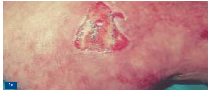
Fig. 1a Condition of the ulcer on March 27, 2003 at the start of applying the new therapeutic approach: local wound treatment with TenderWet to cleanse the wound; compression bandage to counteract the venous insufficiency.